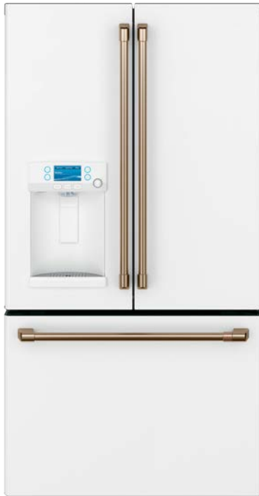
CYE22TP4MW2 Matte White with Brushed Bronze handles