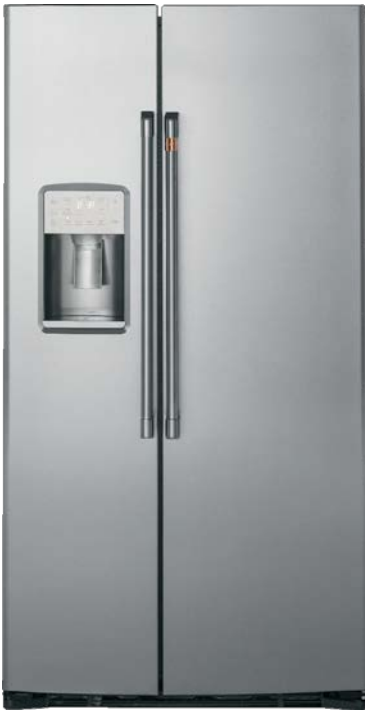
CZS22MP2NS1 Stainless steel with Brushed Stainless handles